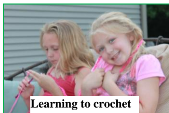
Learning to crochet

Per our usual summer, we were also able to spend a great deal of time by the pool just enjoying the sunshine. The girls learned to water ski this summer through a local ski program. It seems that we have some real water babies on our hands.