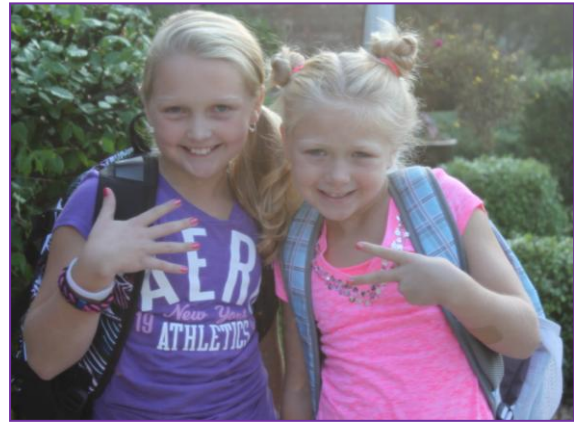
First day of 5 th and 2 nd grade